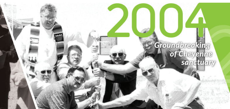
Groundbreaking of Cheyenne sanctuary