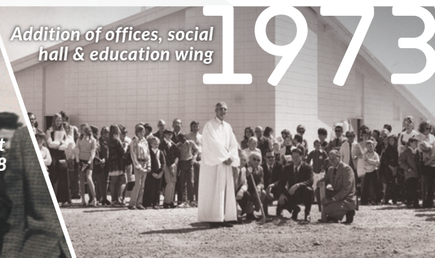
Addition of offices, social hall & education wing