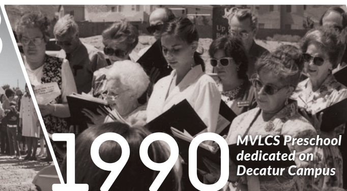
MVLCS Preschool dedicated on Decatur Campus